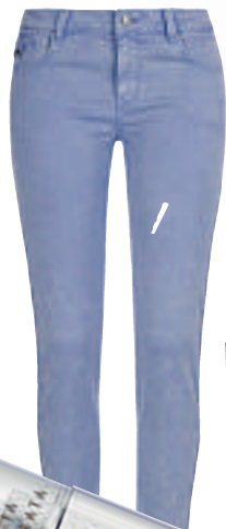
1 Skinny jeans, New Look, €24.99 2 By Terry Touche Veloutée, €45 3 Vita Liberata Skin Plumping Peptide Mist, €28