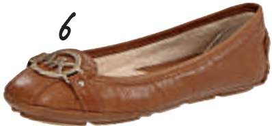
4 Watch, Raymond Weil, €1,119 5 Suede dress, Victoria, Victoria Beckham, €995 6 Pumps, Michael Kors, approx €80

It's exciting to be a Northern Irish female actor who's making waves.